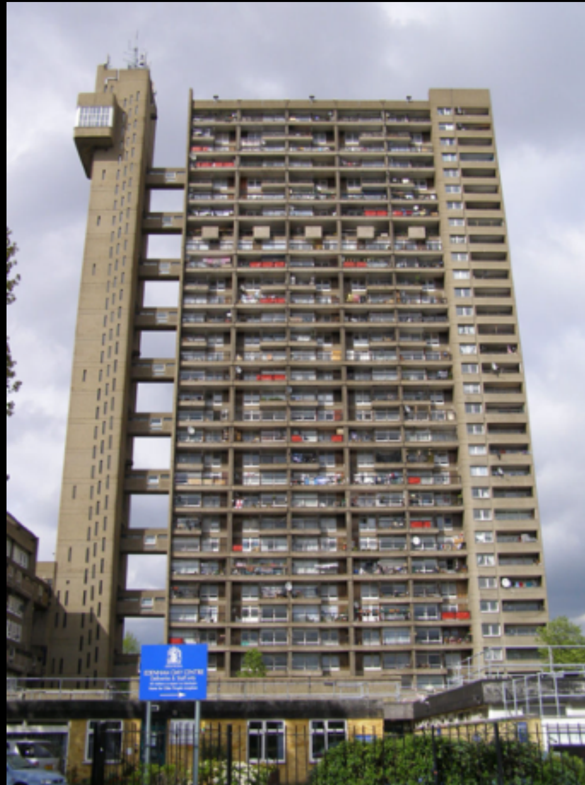
Trellick Tower Built in 1972 by Erno Goldfinger Owner: Kensal Town