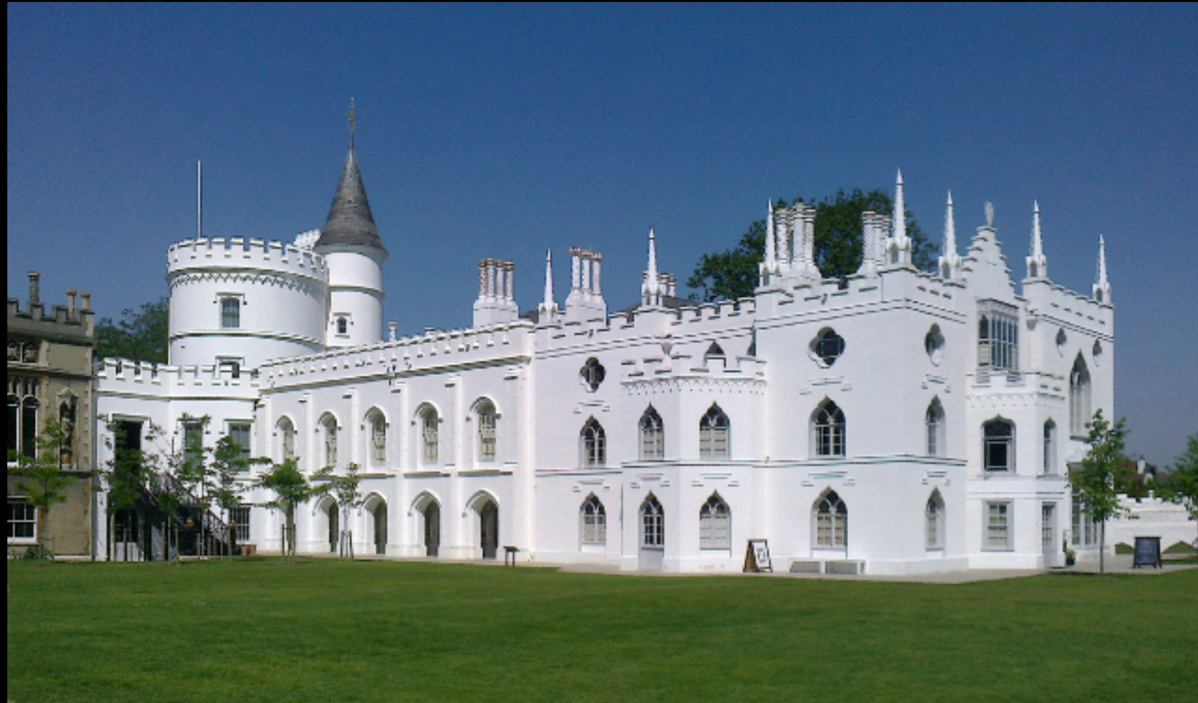
Strawberry Hill House 268 Waldegrade Rd, Twickenham Neogothic Built in 1749 by Horace Walpole